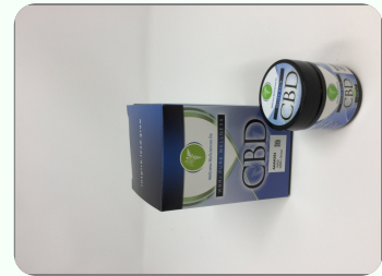
The photos on this report are of a sample collected by the lab and may vary from the final packaging.